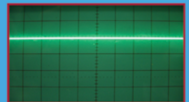
Furman's exclusive Linear Filtering Technology dramatically reduces AC noise.